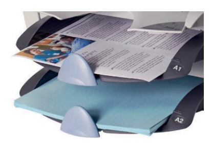
Sheet feeders Load up to 80 sheets. A sheet feeder is included. A second sheet feeder is an available option.