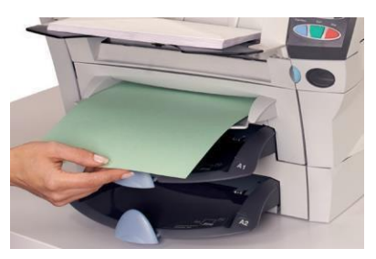
Convenience feeder Give everyday mail a professional look by feeding up to 3-pages stapled or unstapled.