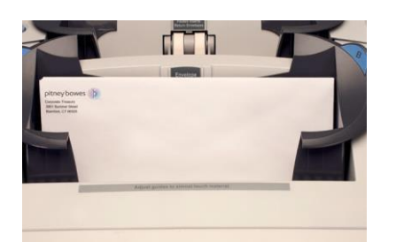
Envelope feeder 60 envelope capacity also lets you load material on the fly for continuous operation.